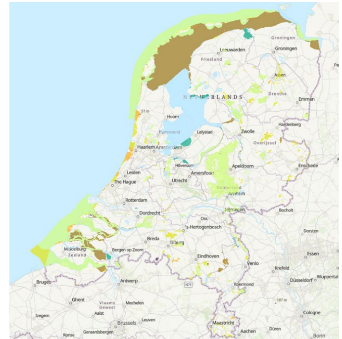
This map shows Key Biodiversity Areas (KBA) and World Database on Protected Areas (WDPA) in the Netherlands.

To address this challenge, a detailed biodiversity analysis was implemented across a diverse (global) portfolio of real estate assets. This analysis, which uses data provided by the world's leading nature conservation organisations, offers a comprehensive overview of biodiversity value, legally protected areas, and the presence of threatened species. The approach included scoping risks, identifying gaps within existing risk assessments, assessing the potential for both threat abatement and habitat restoration, and prioritising sites for further evaluation. This preliminary screening aids in determining the need for engaging biodiversity specialists and developing targeted conservation strategies.