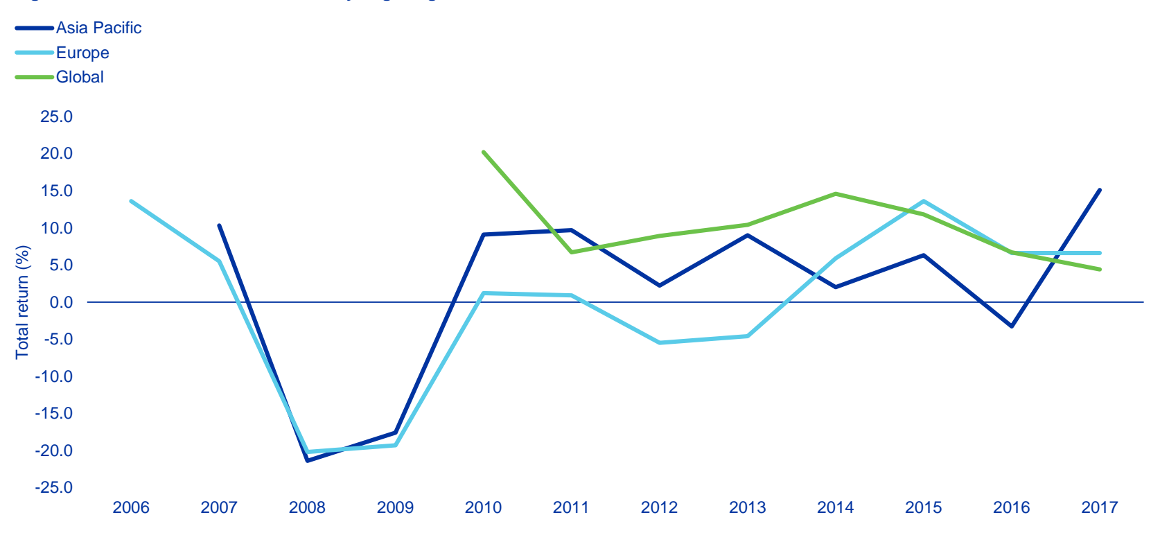
Figure 2: Performance of funds of funds by target region

The full report is available to members at <a href="mailto:inrev.org/library/">inrev.org/library/</a>